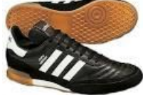
Indoor soccer shoes (two examples)